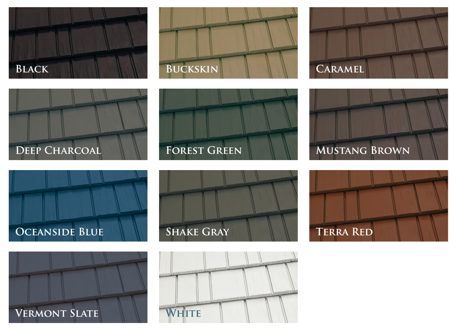
*Actual color may differ. Ask your independent respresentative for true color samples.

Learn more about Great American Shake and other energy saving and environmentally sustainable home improvement products at: