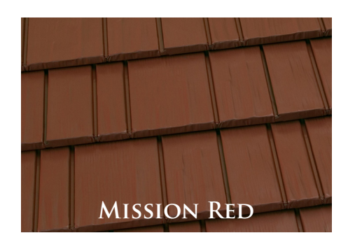
*Actual color may differ. Ask your independent representative for true color samples.